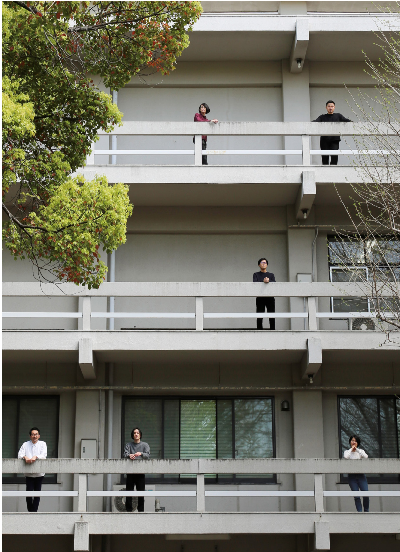
Team BRANCH at Tama Art University, located in western Tokyo.